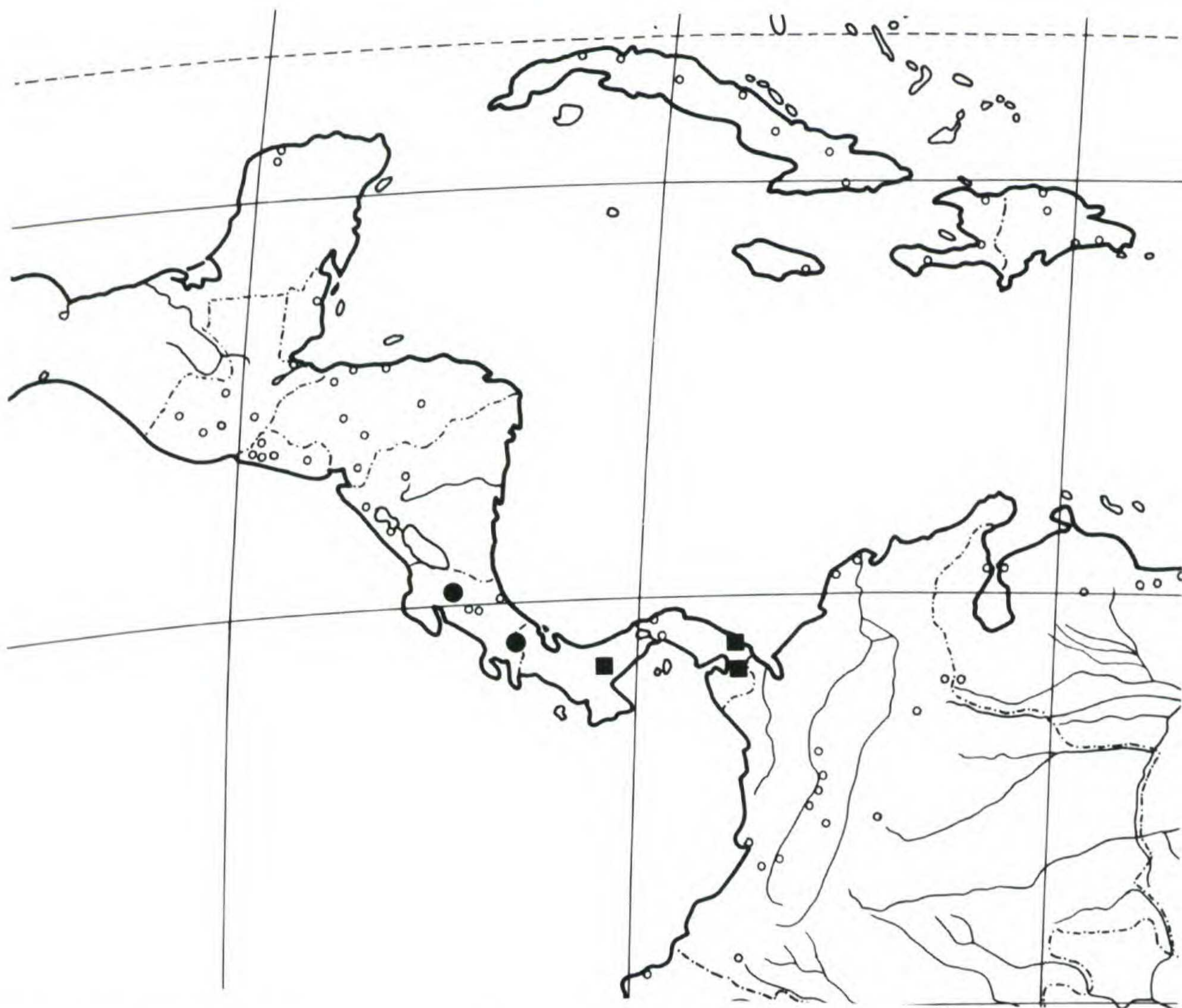
Figure 2. Distribution of D. hartmanniana (circles) and D. whitei (squares).

gyna Jacquin, which dry similarly, are probably quite fleshy on live plants. None of the specimens mention this detail, so future collectors of this species are urged to record this information.